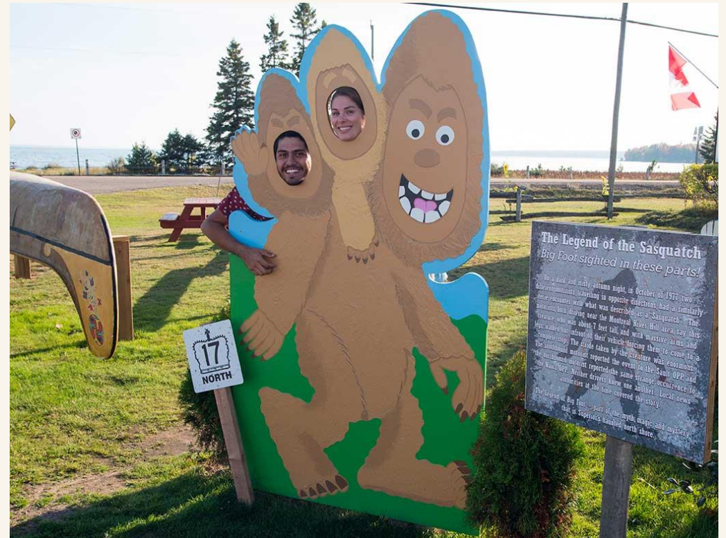
Trans-Canada Hwy 17