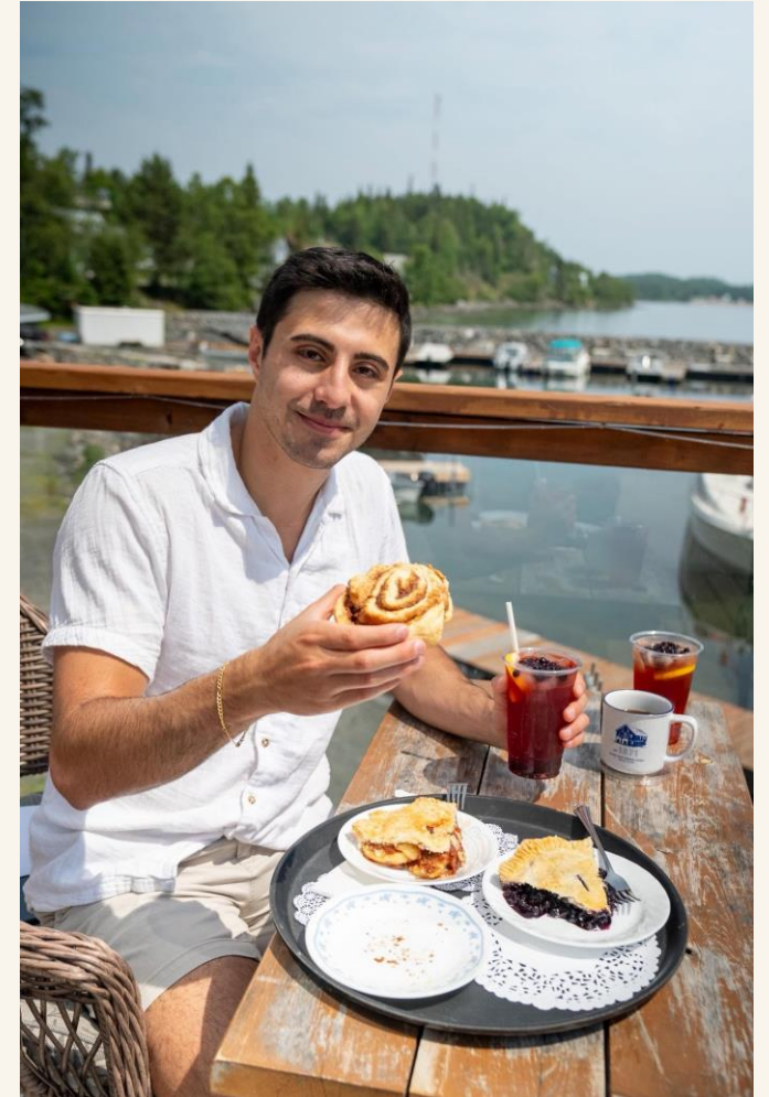
Silver Islet, Superior Country

Local Festivals & Future Events: Stay up-to-date on community events, concerts, and farmers' markets. Advising travellers on what's happening soon is a powerful way to get them to stay an extra day.