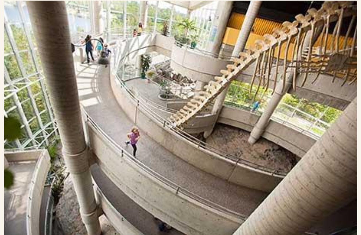
Science North, Northeastern Ontario