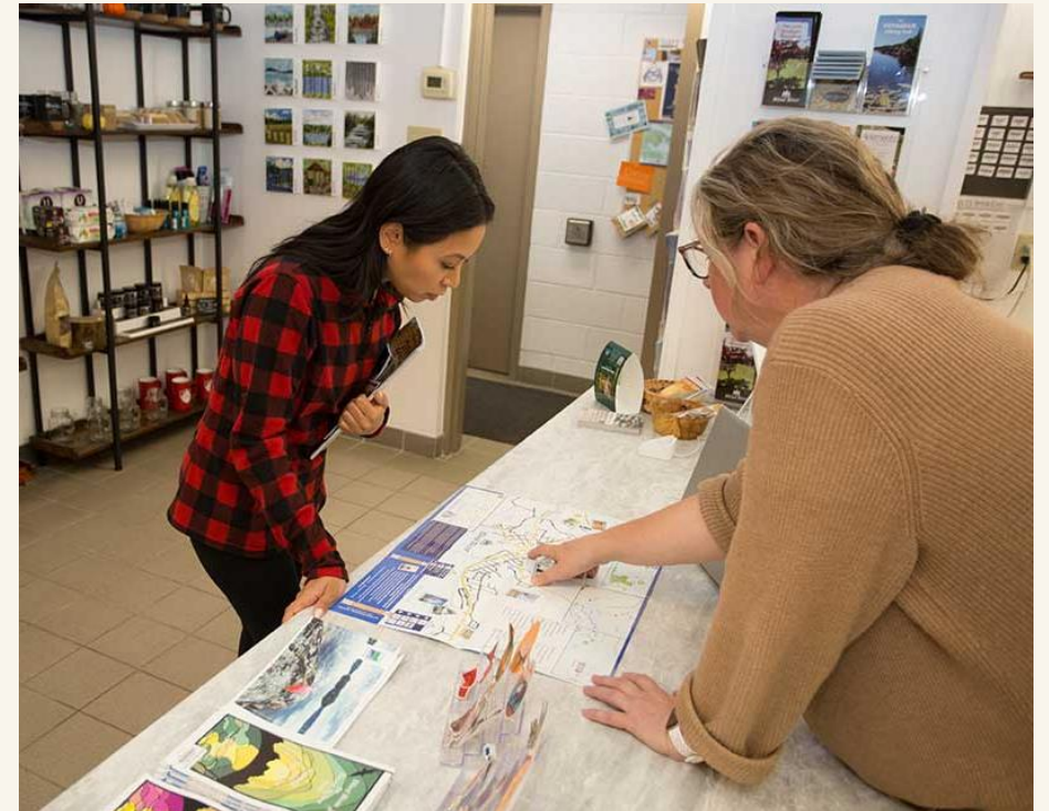
Blind River Visitor Information Centre, Algoma Country

Always Double-Check: Look up official regional websites, business websites, local municipal websites, or social media to verify